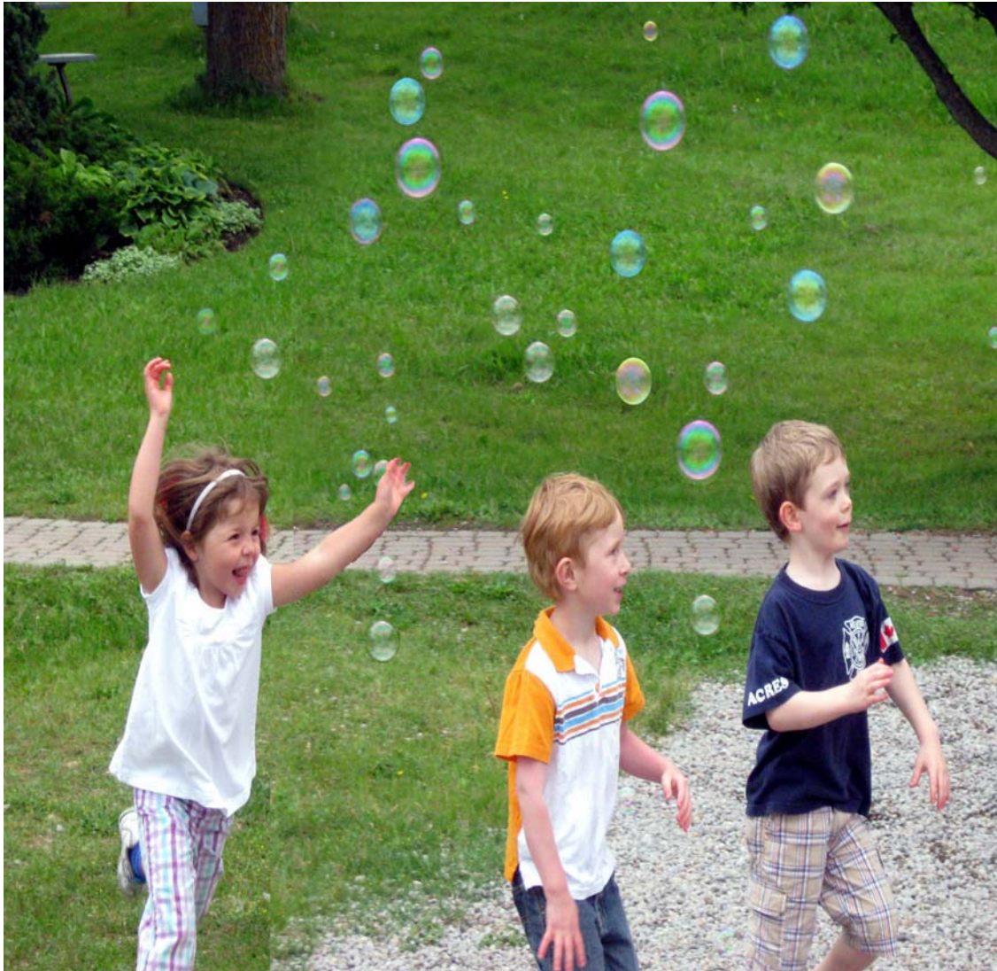
Children enjoy Bubbles and Music at Raper’s Park in Meaford as part of Family PLAY Saturdays.

The Meaford CAN has continued to offer free drop-in activities throughout the school year, including basketball, hip hop, floor hockey and soccer. For the first time, activities will also be offered during the summer months, including drop-in basketball on the outdoor courts for children of all ages. Another new activity the CAN has introduced this year has been Family PLAY Saturdays throughout the month of June, offering an opportunity for Meaford families to explore the parks and amenities in the community, including bubbles and music, a scavenger hunt, kite flying and mini golf.