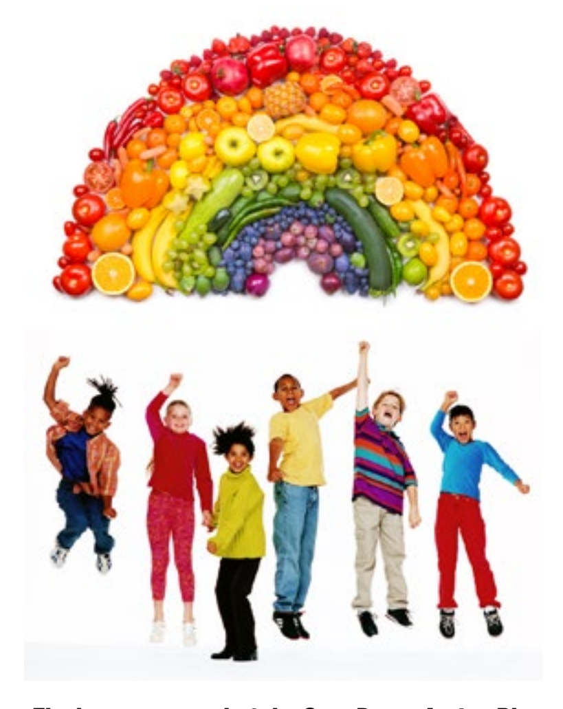
The long-term goal of the Grey Bruce Action Plan: All facilities serve healthy food and beverages.