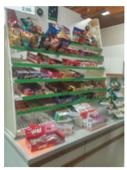
In food concessions (left to right): Nacho machine, slushie machines, chocolate bars and chips