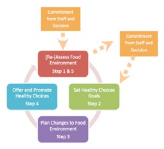
Step-by-step approach to offering healthy choices in your facility or community