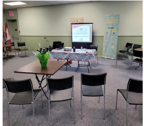
It's Not Right Session in Mildmay, March 27, 2024

Home Takeover is a form of elder abuse and can increase the vulnerability of older adults to other types of abuse. A local project is underway that addresses the risks of elder abuse. The project is led by the Grey Bruce Elder Abuse Prevention Network (GBEAPN) and aims to increase awareness and build community capacity to reduce the incidence of elder abuse. Older adults have been attending educational sessions throughout Grey-Bruce to learn about the risks, identification, and response to elder abuse. As part of the educational program, called " It's Not Right ", participants learn about the issue and impacts of home takeover. Older adults can be targeted and are especially vulnerable to victimization through financial exploitation. The Grey Bruce Community Legal Clinic provides public education upon request about legal issues relevant to protecting older adults from abuse, such as tenant rights and powers of attorney. For more information about the Elder Abuse Prevention Project or GBEAPN, contact Angela Yenssen at angela.yenssen@gbclc.clcj.ca