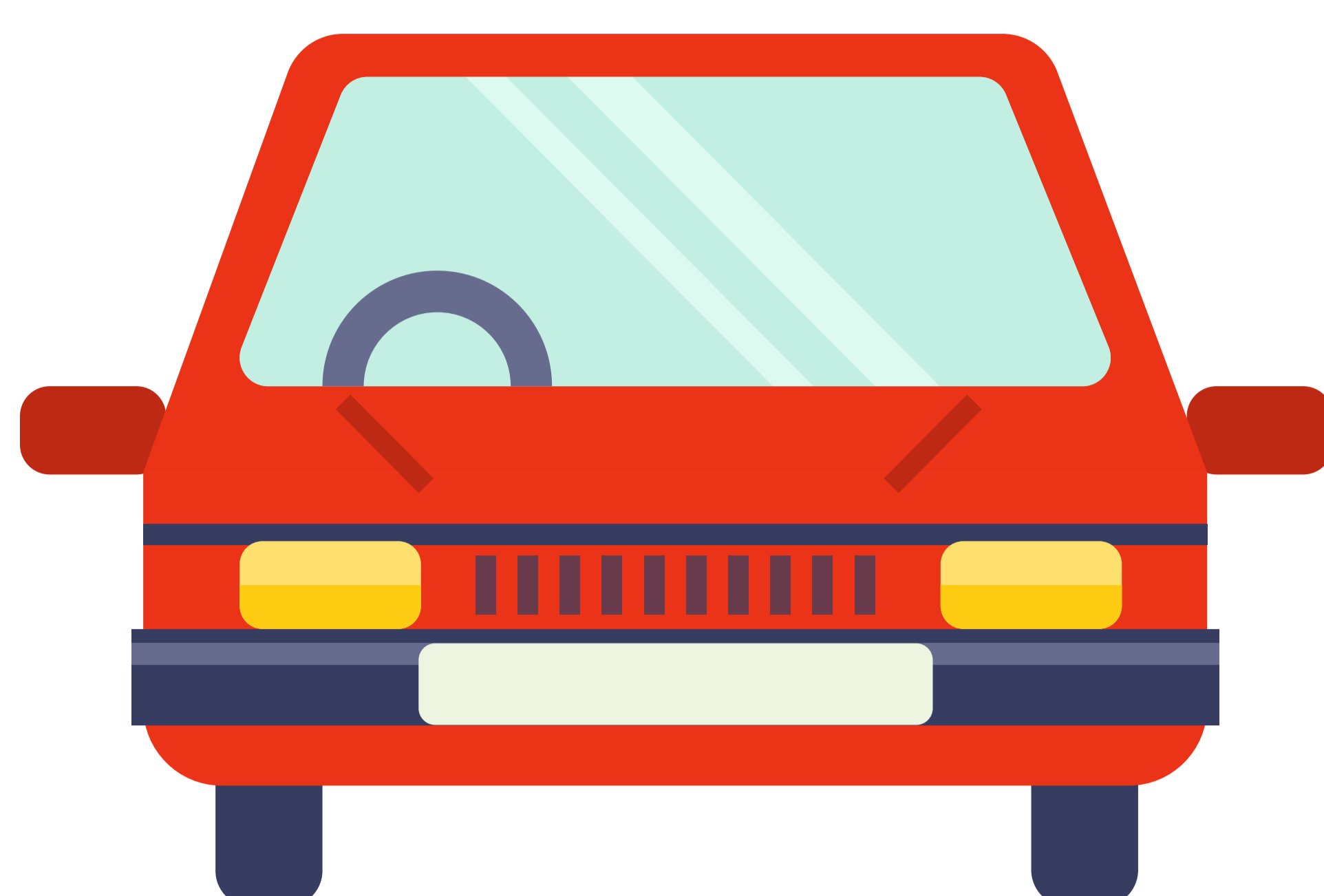
Figure 1. Percentage of Grey Bruce Drivers Aged 19+ Who Drove a Motor Vehicle While Drunk in the Past Year, by Year

According to the most recent estimate, around 4%* of Grey Bruce drivers aged 19+ drove a motor vehicle while drunk in the past year. This rate has remained fairly stable over time (see Figure 1 below).