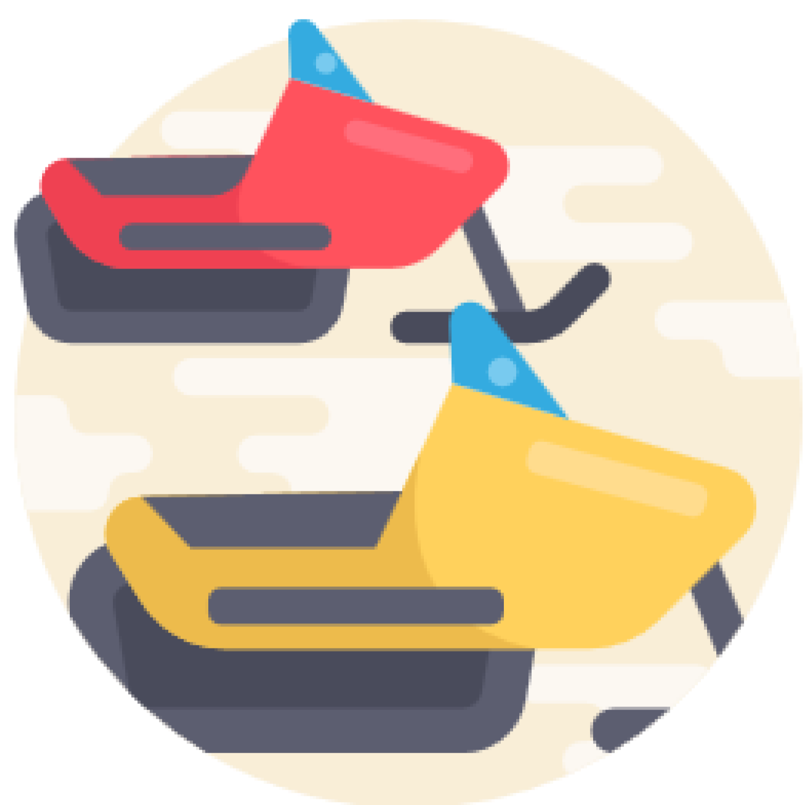
Figure 2. Percentage of Grey Bruce Recreational Vehicle Drivers Aged 19+ Who Drove a Recreational Vehicle While Drunk in the Past Year, by Year

Examples of recreational vehicles include snowmobiles, boats, and all-terrain vehicles.